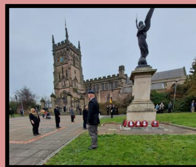
Immanuel Church, Birmingham

The Cenotaph at Kidderminster where a wreath was laid on behalf of all Kidderminster Masons