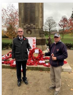
Cenotaph, Mary Stevens Park, Stourbridge

Freemasons have always had a strong relationship with the armed services, and UGLE has worked with Remembrance Penny who have donated a bronze poppy, in a case, inscribed with the words